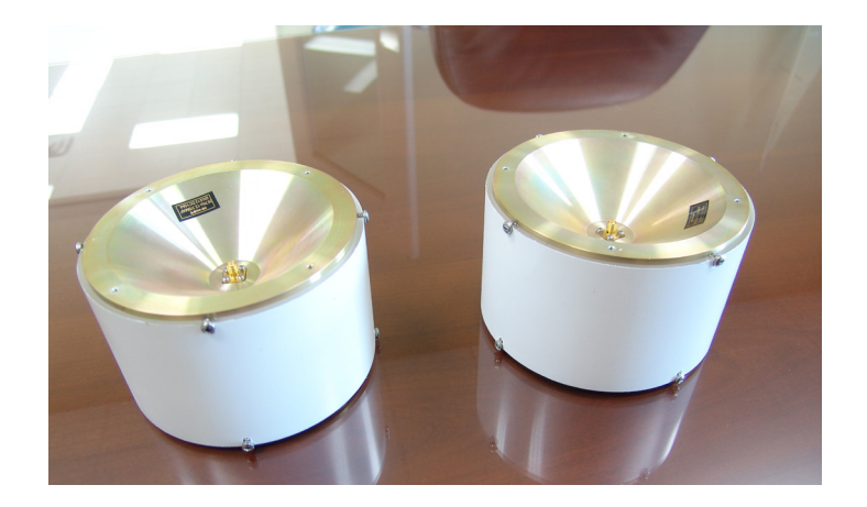
Consult Mi-Wave for complete dimensional outline for the application and specifications required.